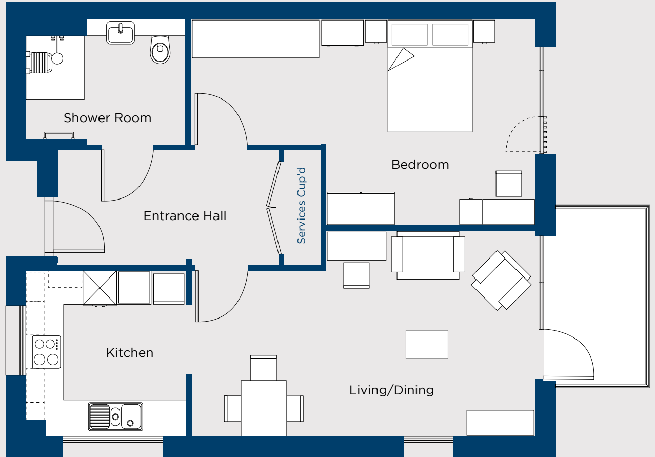
Flat layout B - all flats come unfurnished