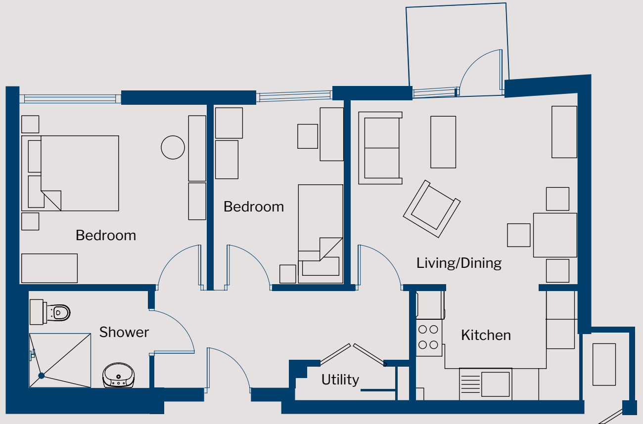
Two-bedroom flat - all flats come unfurnished